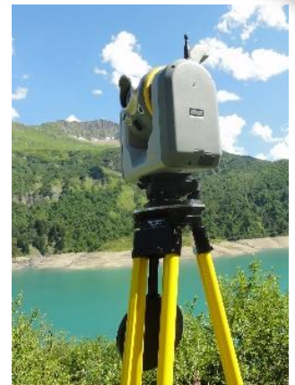
1 TRIMBLE SX10