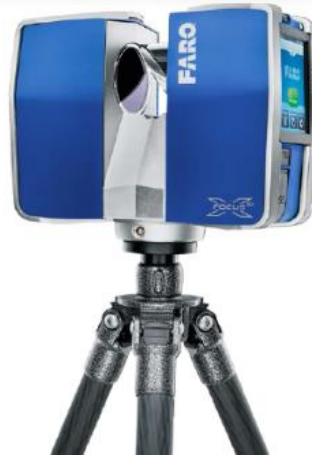
1 x FARO Focus X130