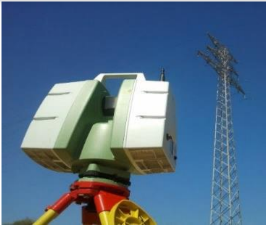
2 x LEICA Station C10